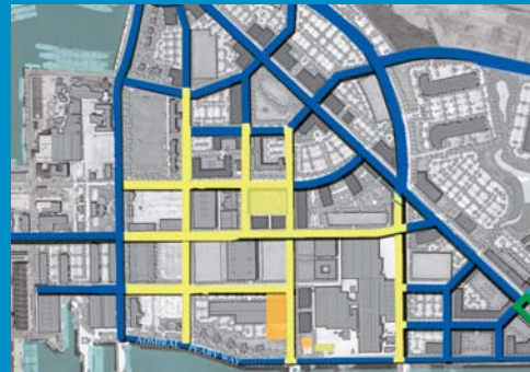
Civil Engineering, Landscape Design, Construction Inspection, and Owner's Representative Services for The Navy Yard Town Center Infrastructure Improvement Project Philadelphia Industrial Development Corporation (PIDC)