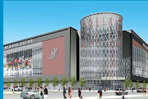
Foundation design for New Jersey Devils Arena Newark Housing Authority